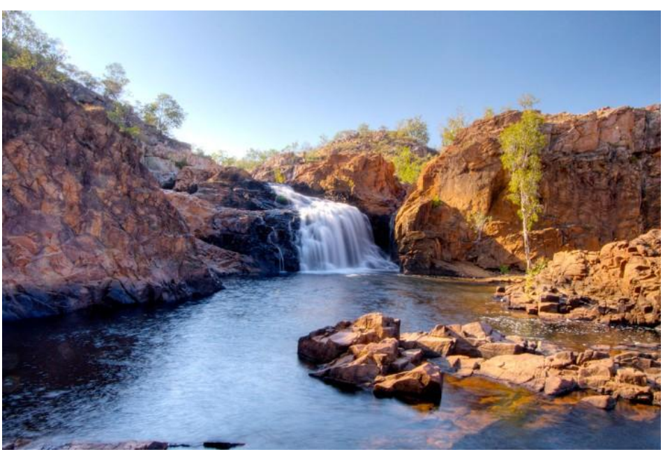
Sunday January 19