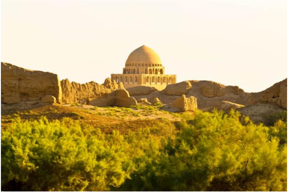
Saturday January 18