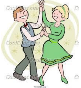
Squares and rounds go hand in hand

CLARIFICATION for new readers: this newsletter is issued on Sundays with info for the coming week. It lists days of the week starting with the Monday immediately following the Sunday of issue. Under each day of the week header there is a list of the dances offered that day, complete with location (street address and town), caller/cuer, contact person's phone and/or email, times plus other info such as dance level(s), attire, bring food to share, etc as applicable. In order to emphasize changes, special events, etc, the very first section of the newsletter, Highlights for this week , only lists changes to regular dances of the week or reminders of special events. Similarly, the Looking ahead section lists advance notice of events to take place later. For full information on any dance mentioned in the highlights for this week section please scroll down to the appropriate day of the week header to find the info you are looking for. The end of the newsletter is reached when you see a small cartoon and the words "Squares and rounds go hand in hand". Line dancing" has been added to the mix.