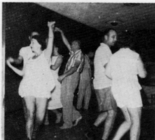
Pajama game is played at Fort Harrison in Clearwater Sept. 2.