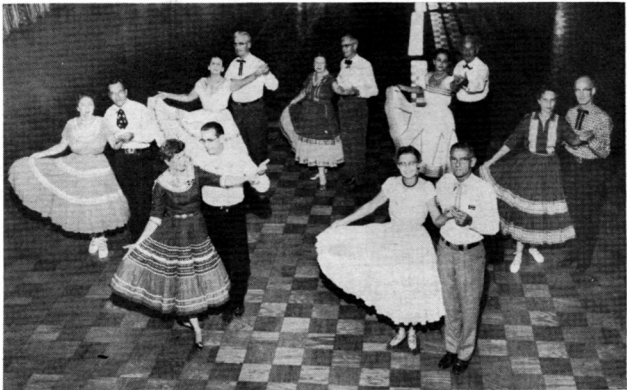
A group of Clearwater round dancers try out an exhibition dance for "Holiday for Rounds" on the Fort Harrison's new enlarged ballroom floor.

Throughout the state all round dance leaders are encouraged to attend this first convention and to participate in a meeting in the Fort Harrison Hotel at