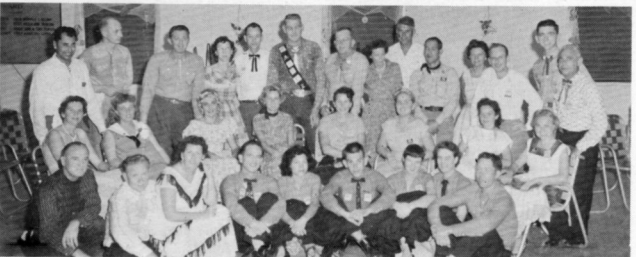
Members of the Coral Twirlers of Key West are shown above. The club dances regularly on Saturdays in the Jaycee clubhouse.