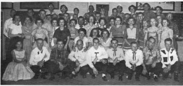
Third largest Knothead party in Florida history saw 26 couples from Winter Haven pass the test at Daytona Beach recently.