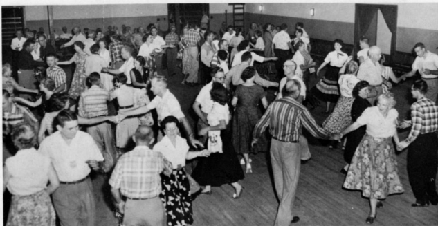
Members of the beginners square dance class sponsored by the Melbourne Allemanders are shown in this picture made in the Trailer Haven hall.