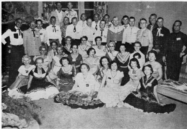
Forty-seven Floridians attended the Fall Swap Shop at Fontana Village, a turnout which prompted Fontana Officials to describe their results from Bow & Swing advertising as "excellent." Above picture shows those in attendance at the pre-Swap-Shop.