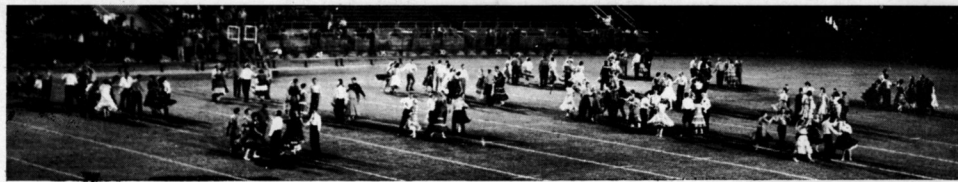
Several score of square dancers representing various clubs in the Jacksonville area participated in a mass exhibition in the famous Gator Bowl as a grandstand feature of the Greater Jacksonville Fair in mid-November. Ernest R. "Bart" Bartley called and directed the spectacle, which was a joint activity of callers and dancers' organizations in Northeast Florida.