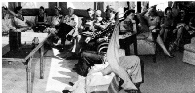
The Yacht Kay-Bob, on a cruise on the St. Johns River, formed the backdrop for the annual meeting of the Florida Federation of Square Dancers recently. Delegates gathered in the afterdeck (left) for their meeting while ladies enjoyed the view from the cabin.