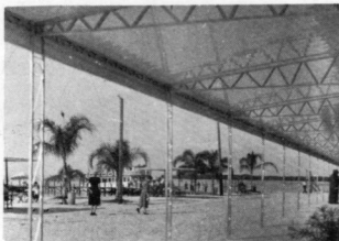
Scenes at the opening of Coral Corral include (above) the boat from St. Petersburg as seen from the veranda of the dance hall.