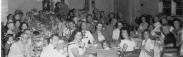
Members of the Melbourne Allemanders enjoyed a gala Christmas party on Saturday, Dec. 19, following the pot luck supper pictured above. The club had its annual business meeting on Jan. 16.

1460 WASHINGTON AVE. MIAMI BEACH, FLA. TEL JE 8-8794