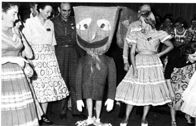
Above and below are scenes of the Man from Mars skit at the Silver Swing-a-Nar institute held at Silver Springs early in November.