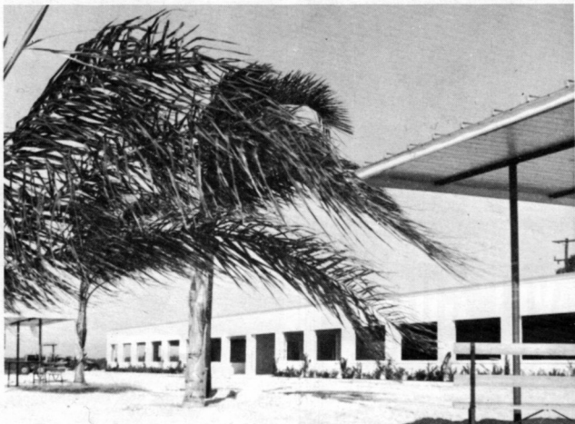
Uncompleted as Bow & Swing went to press, the new pavilion at Bahia Beach will have a test run before New Year's, will be officially opened Jan. 10.

The Magazine Of Square Dancing In Florida