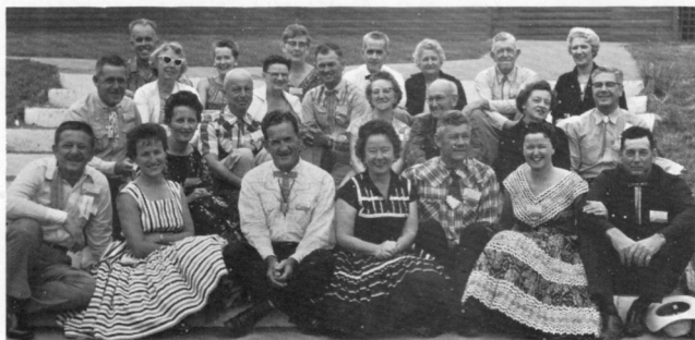
Florida's contingent at the Spring Swap Shop included these dancers representing all parts of the state.