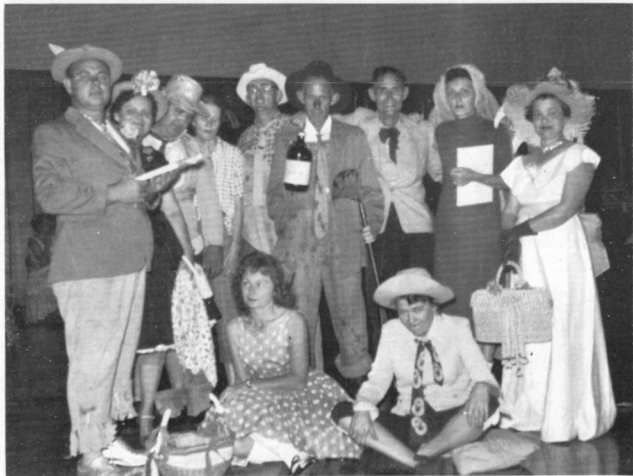
Members of the Clewiston Kane Cutters who participated in an April Fool's Day skit are shown above. The mock hillbilly wedding was complete with costumes, jug of mountain dew, shotgun, etc.