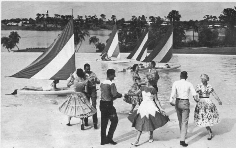
Square Dancers warm up for the 100 Lakes Jamboree beside the new Esther Williams Aquarama Swimming Pool at beautiful Cypress Gardens, Florida.