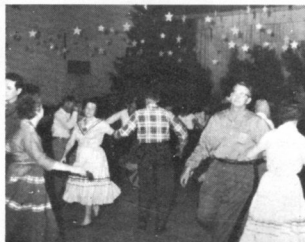
Food and fellowship and plenty of dancing were enjoyed at a holiday party in Ocala recently.