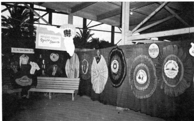
A corner of the square dance booth at the Greater Jacksonville Fair held during the Armed Forces Day weekend. Dancers representing various clubs manned the booth, dancers representing all age groups maintained demonstrations for the public.

1460 WASHINGTON AVE. MIAMI BEACH, FLA. TEL. JE 8-8794