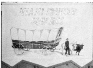
Colorful banner of the Miami Pioneer Squares is shown above.