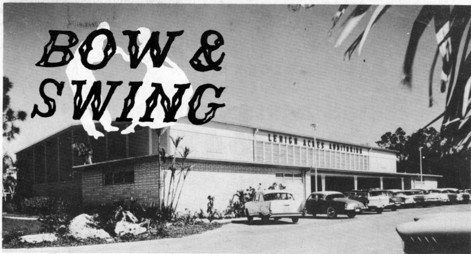
The fabulous Lehigh Acres Country Club Motel is the scene of the Fort Myers Jamboree in mid-November. Four round dance instructors and a dozen callers provide a full program designed to appeal to dancers from all parts of the state

Roundup of Square Dance News for November: