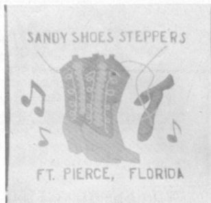
Club banners of the Sandy Shoes Steppers of Fort Pierce (above) and the Dixie Twirlers of Miami (below) are pictured.