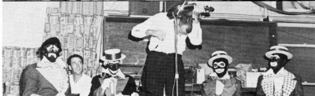
You don't have to be an idiot to participate in the "after after" parties, but it helps, as this post-midnight (top) photo attests. The bottom picture was made during Minstrel Night at Fun Fest, one of the entertaining after parties.