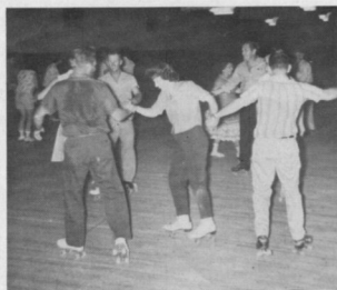
Square dancers earned their Butts Up badge while dancing on roller skates at a recent Lake Worth Promenaders outing. Over 60 dancers attended, five squares dancing on skates.