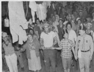
Square 8 Dance Club of Panama City recently entertained couples in their current dance class with a Hobo Ball. Photo shows part of the square dance group during grand march.