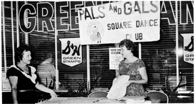
Publicity push given beginner square dance classes in Florida is illustrated above as members of Pals & Gals Club of Lakeland distribute WCSRDA brochures at Publix Market, Southgate Shopping Center, Lakeland.