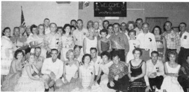
In mid-August the Who Goofed Squares of Palm Bay Estates entertained over 50 dancers making a Knothead trip from West Palm Beach.