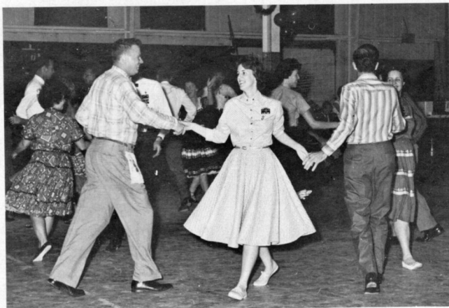
New Year's Eve at Eau Gallie Civic Center was celebrated by square dancers from the Missile Twisters, Harbor City Squares and Comet Club. Photo at left shows some of the happy dancers.