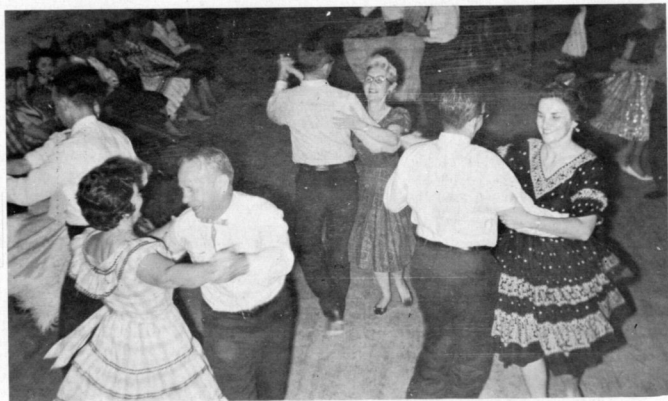
The gala New Year's Eve party staged by the Merrysteppers Club of Gainesville produced happy scenes like the one shown in photo at right.