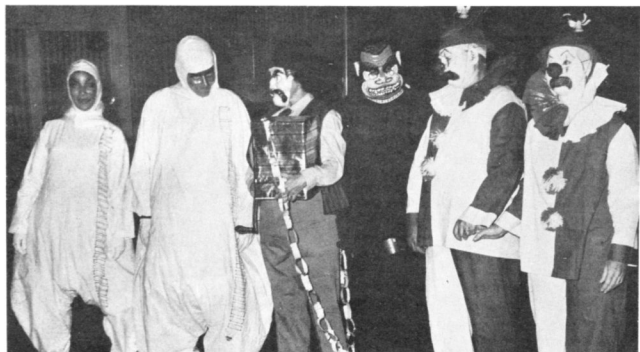
Gala costume party at Florida Callers Association annual meeting in Fort Lauderdale developed these prize-winning costumes.