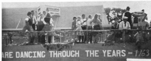
Panama City square dancers took part in the 50th anniversary celebration of Bay County by dancing on float in local parade.