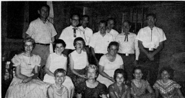
Charter members of Tallahassee's Capital Squares pose for group photo.