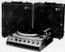
WORLD RENOWN 1640 MHF 2