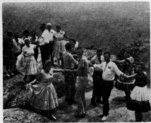
Floridians square dance atop Caesar's Head while vacationing at Rainbow Lake Lodge near Brevard, N.C.