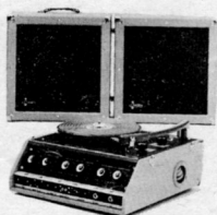
EXCITING NEW TRANSCRIPTION RECORD PLAYERS