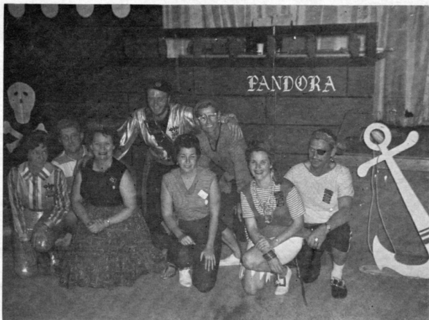
Group of "Pirates" are shown in front of the pirate ship, Pandora, at the Pirates Dance held at Lake Mary School, Sanford, on February 12. There were 22 squares in attendance.