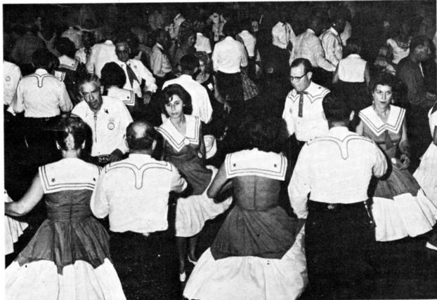
Ocean Waves in action at Firecracker Festival in Miami.