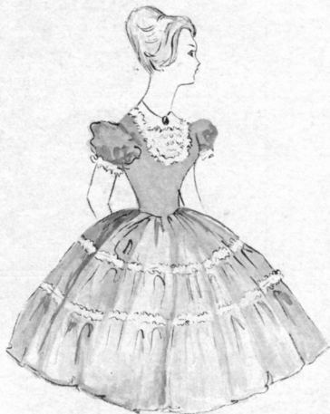
A lace trimmed skirt that whirls to a six-yard sweep is topped by a sissy lace bodice with puff sleeves in this Chez Bea design. Available at Chez Bea Square Dance Creations in North Miami, the dress is fashioned in green, pink, hot pink, lavender, blue, aqua, lime, red, white, yellow or black. Sizes 8 to 18 and half sizes. Dacron®-cotton blend, about $24. Cotton, about $19.