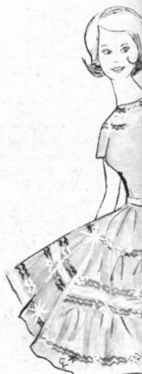
Fashion designer Bill Bettina designed this dress for dancing. It features wide whirling skirt and braided ric rac and braid. Available in washable Georac in yellow, red, turquoise, taffy, beige, apricot, blue. Available at St. Petersburg, Florida. States and Canada. $25.