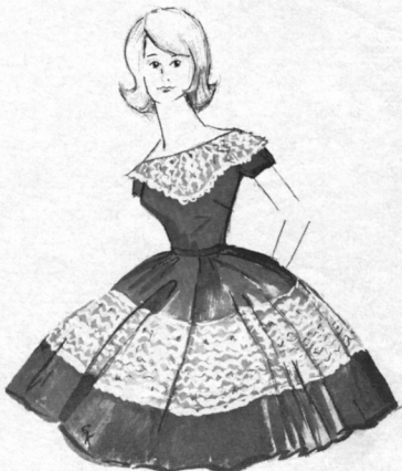
A ten-inch tier of lace and metallic sparkle at the skirt and scalloped collar enhances this dress from the Quality Shop at St. Petersburg. Styled with self belt, and cap sleeves, it's available in scarlet, black, light blue, avocado, tangerine, lilac, Nile green, pink, yellow, cinnamon, turquoise, and white. Designed by Bill Bettina in cotton broadcloth. Sizes 8 to 20. About $16.