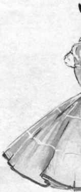
The Square Dance Shoppe takes a basic broadcloth and adds a nylon dotted swiss trim. It's a signed outfit that can be worn with or without the overdress. Available in blue, pink, yellow, red and white. Overdress, about $9.