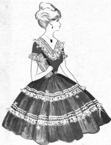
A beau-catcher at any holiday dance is this 100% Arnel® crepe dress trimmed with ruffled cotton lace and glittering metallic lurex at the v-neck, sleeves and whirling skirt. It's designed by Fay Creations of Denver in pastels or dark colors with gold or silver trim, and available at Parrish's Square Dance Shop in Lakeland. Junior and Misses sizes. About $25.