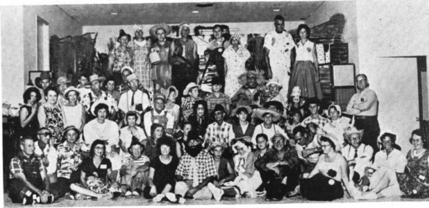
These Sandspurs of Winter Haven outdid themselves in planning and presenting their Mountain-Dew Do party in October. A still graced their refreshment table and an oldtime privy decorated the dance floor.