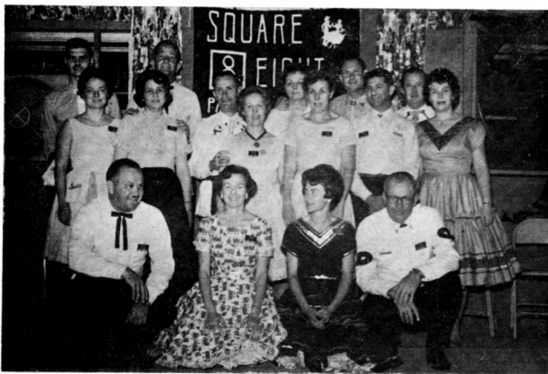
Members of Tallahassee Twirlers recently visited Panama City's Square 8 club where this picture was taken.