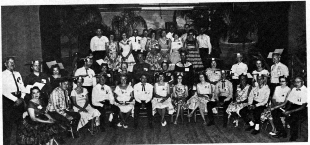
"Onward Upward" was the party theme when these Dixie Squares new dancers were honored at their graduation dance at Daytona Beach.

The Micco Mixers of Sebastian haven't been fighting fires. . . they just had to move all the fire fighting equipment out of the Micco Community Center to accommodate the dancers May 28, when four clubs visited the Mixers with the hope of retrieving their banners. . . Harbor City Squares from Eau Gallie, Melbourne Allemanders, Comet Squares from Patrick AFB and the Missile Twisters of Melbourne each brought at least one square. . . and there were dancers from the Circle