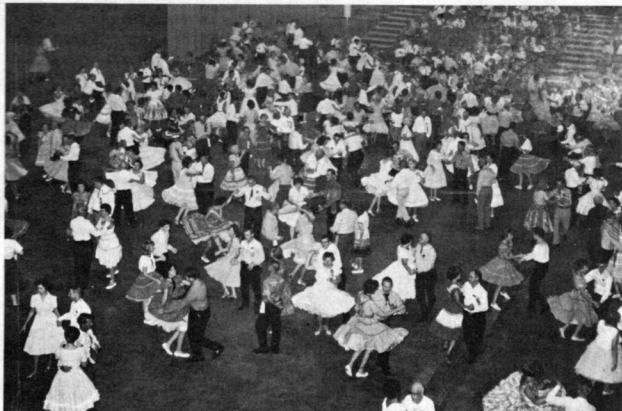
Curtains were parted to provide greater air conditioning for the Friday night dance in Tampa's fabulous new convention hall; next night entire area was full of dancers.