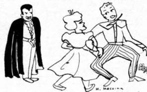
They say he has some great ideas about new blood for the club.

□ Rhythm Squares' first dance in their new hall at Holiday Park found nearly 250 dancers in attendance . . . the new hall is reported to have good air conditioning and acoustics, and the members say they are looking forward