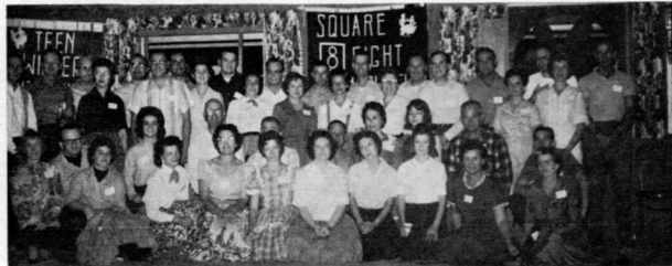
New class graduated by Panama City Square 8 club is pictured above. There were 44 members in the class when this picture was made at the halfway mark.