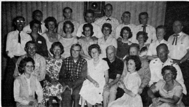
Pictured is another Sanford beginner's class that recently graduated. They will now be added to the rolls of the Starlight Promenaders.