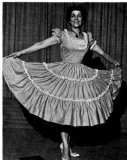
In most wanted colors, trimmed in fine white lace.