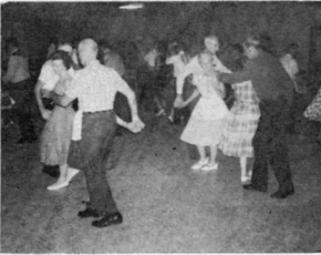
Part of crowd at recent 7th Anniversary Dance of Tampa Dancers Association, Tampa.