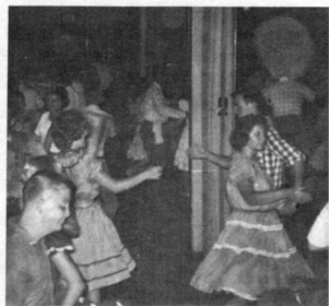
A square of teenage dancers in the middle of a right and left grand at the NEFSDA dance in Palatka.