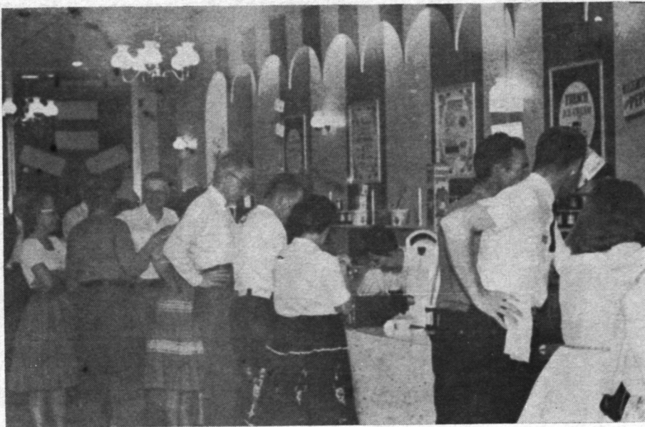
Orlando's Pioneer Club danced the last three tips of their March 3 dance at the Dipper Dan ice cream parlor.