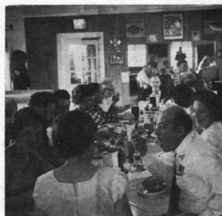
These Square 8 and Teen Twirlers dancers stopped for a catfish supper on their way to Thomasville, Georgia dance.