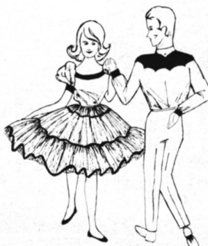
STAR (left or right)