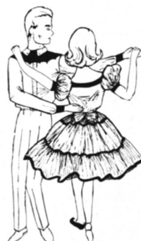
SIDECAR (left hips adjacent)