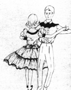
BANJO (right hips adjacent)