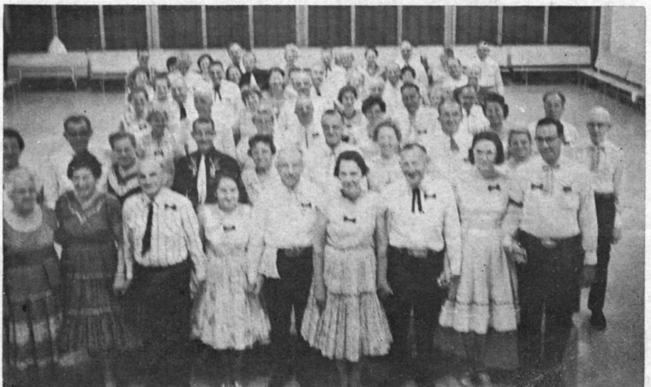
These Englewood Buttons and Bows dined and danced at their January 1 affair.