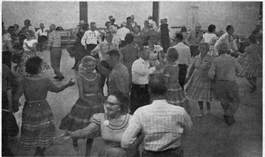
Clearwater Legion Squares were in the swing at their December 27 dance, the club's last affair of 1965.