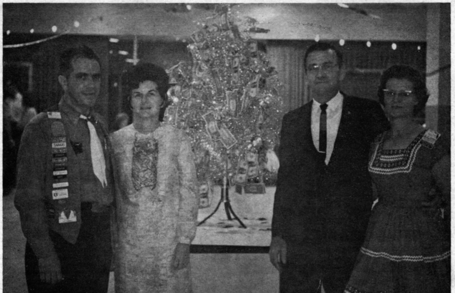
Miami Grand Squares dancers pose with unusual Christmas tree at their annual Yule party. Dollar bills which decorated the Squares' tree amounted to $130.00 and were donated to the Sunland Training Center.