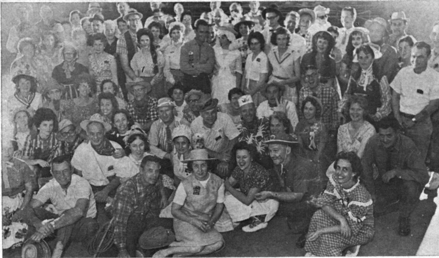
Whirl and Twirl Club's attendance record was broken April 29 when 14 squares were in the swing. Guests for the evening were from the Forest Hillbillies of Tampa.