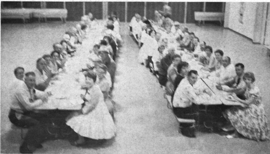
Buttons and Bows of Engelwood dined and danced at last month's Hard Times Party.