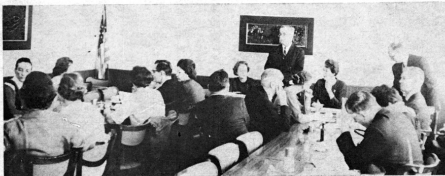
Members of the State Convention Committees met in Orlando during January to plan for the June 17 and 18 event.

The most recent benefit dance was held in Fort Lauderdale February 6. Sponsored by the Southeast Dancers Association and the Southeast Callers Association, the dance netted $1200 for the fund.