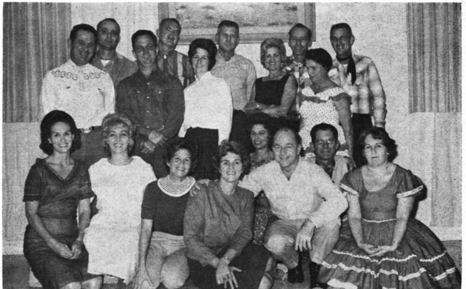
Executive board and committee members of the new Palm Beach area club, the Sidewinders, attended the club inagural meeting.