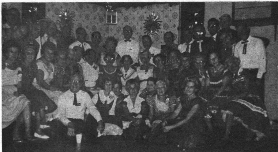
A late gathering of Lads and Lassies at the Ox Bow in St. Petersburg.

Open Evenings 'Till 9, Including Sundays