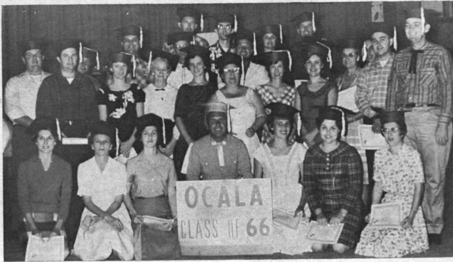
These recent graduates of Howard Rohrbacher's class in Ocala have become members of the Ocala Square Dance Club. Graduation party night was January 13.