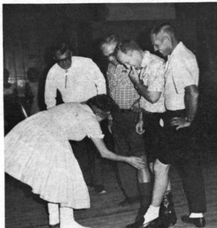
Can a law identify her husband by feeling his knees? Tampa Toppers found out that she can't at a July 30 party dance.