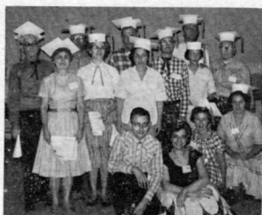
The dancers above will soon be seen visiting the Northeast clubs and perhaps attending the State Convention. They are members of the Fun and Frolic, Jacksonville, graduating class.