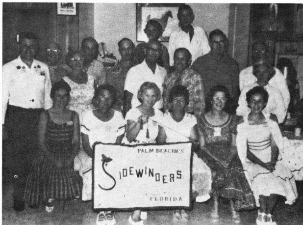
These Boynton Beach Castoffs made a banner snatching expedition to visit the Siders of West Palm Beach. They posed above for photographer with the evening's booty.