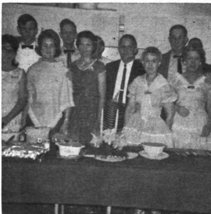
Capital Squares, Tallahassee, celebrated their 5th birthday with a covered dish supper. A club birthday cake with floral decorations and candles graced the Capital Squares' buffet table. Club members say they are proud of their happy five years.