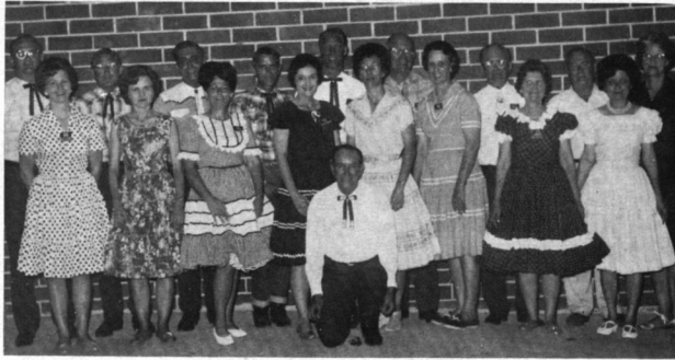
Lake City Squares posed for photographers at a benefit program sponsored to raise funds for exceptional children in Lake City.