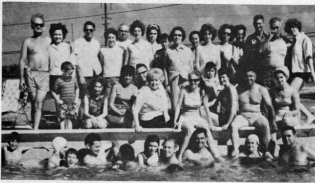
These Westernaires of North Miami spent an enjoyable weekend in Marathon earning their Knothead badges.