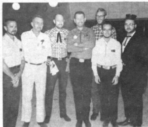
These Titusville dancers are not members of the House of David . . . They're Twirl-Aways who are growing beards for the coming centennial celebration.