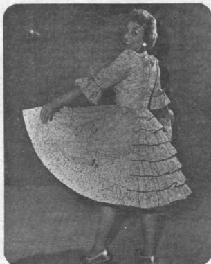
Different! But how attractive is this Dacron and Cotton wash and wear print. Sleeve treatment and the sissy front make this number a conversation piece.