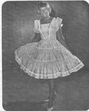
Hot Pink Dacron and Cotton wash and wear, lace and braid trimmed. Comes in a variety of colors, attractively priced for such a beauty.