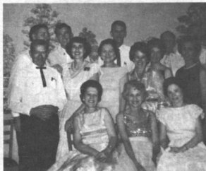
Group of round dancers taking a break at the February 24th round dance party held at the Hotel Duval, Tallahassee.