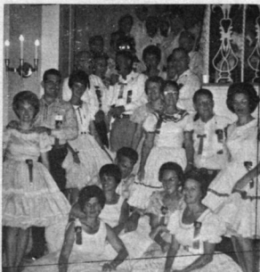
27 of the 28 members of Westernaires of North Miami are pictured in the lobby of the Jack Tar Hotel, Clearwater, during Knothead Konvention held on Labor Day weekend.

Southernaires plans Christmas dance and pot luck supper Dec. 22 beginning