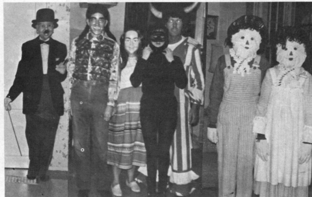
Above grouping are members of merry dancers masquerading at recent dances around the Panhandle area. Recognize anyone?

[ ] Friendly Squares of Panama City held a combination graduation and Christmas party where 20 new dancers joined the ever-growing ranks of Florida's square dancers.