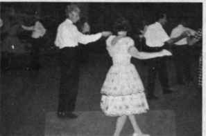
Their pleasure is dancing. Group attending fourth Sunday rounds at the Indian River City Power Plant, US 1, sponsored by Rhythm Rounders of Titusville.

27-28 In CP M facing Wall vine down LOD side on L, cross R(1B) of L(W X1B also), side L, cross R (1F) of L(W X1F also) (the vine is slow);