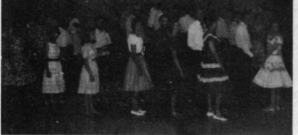
These members of the Titusville Twirl-A-Ways square dance club are also participating in a current round dance class sponsored by the club.

8 Step side twd Wall on R(W twd COH on L), hold 1 ct; touch L to R, hold 1 ct;