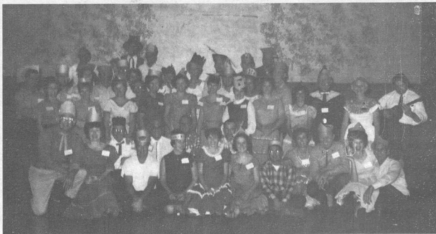
Over 25 new member couples were graduated from Whirl and Twirl's fall class in January. Initiation of the above group was held January 24.