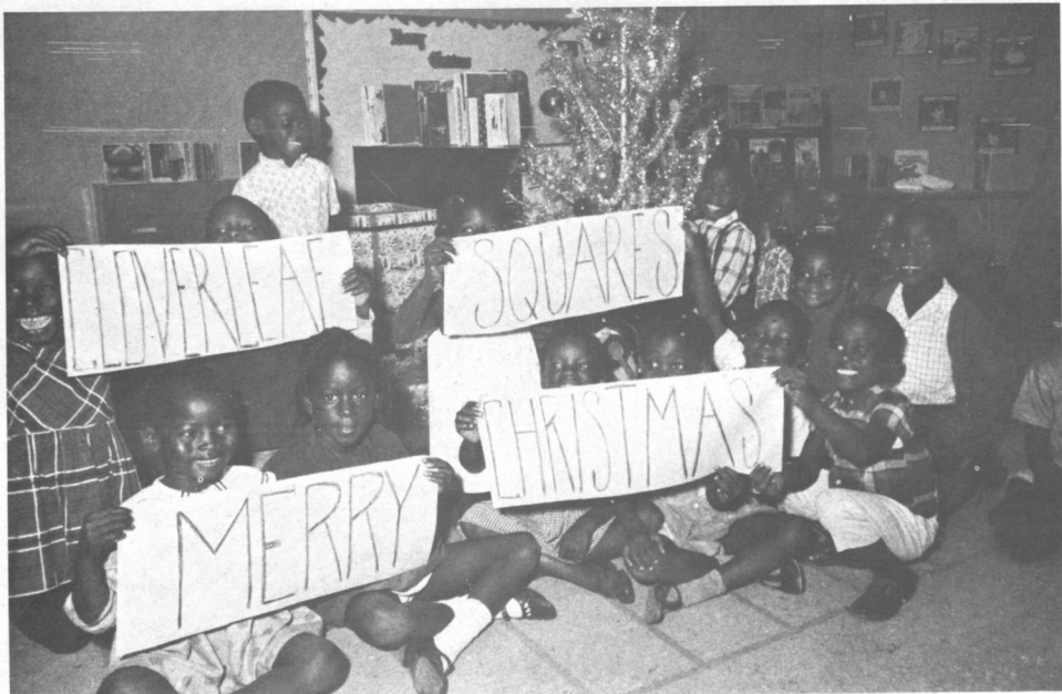
Cloverleaf Squares, Miami, with true Christmas spirit, provided a never-to-be-forgotten Christmas for needy children from Douglas Elementary School. From the happy smiles above, children had a very merry holiday due to club's generosity.