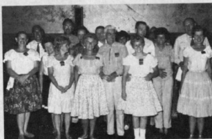
Pictured above are newly elected officers of Whirl & Twirl Club, Orlando, (front row). Nominating committee happily bringing up in the rear.