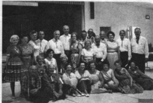
"Never thought we'd make it" said most of these graduates of Town Squares, St. Petersburg, at the beginning of their lessons. Graduation day was in April.