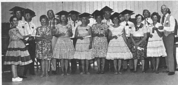
Graduates of Lehigh Pairs and Squares receive diplomas at their recent graduation.

More information will be provided in future issues.