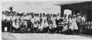
Florida Callers Association Spring Clinic, held at West Palm Beach, Square Dance Center, brought 60 callers together on April 7.