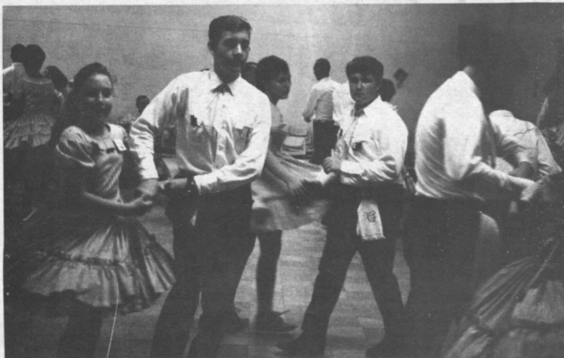
Square of Highland Squares teenagers from South Daytona as they display their dancing ability at April 1 graduation.

[ ] The Dixie Federation dance held in Albany, Georgia, on March 30 was well represented.