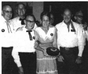
Mr. Sun Sets Club celebrates its 13th Anniversary with a party on June 10th.