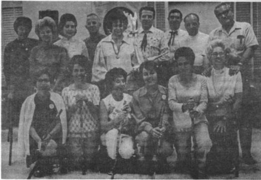
NEW KANGAROOS! These Ocean Waves were presented with authentic "Kangaroo Sticks" at the recent 7th Anniversary Party. They had been 'admitted' into this wonderful group in the past year!