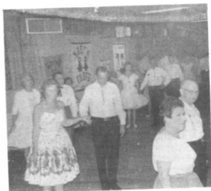
Round Dancers 'que' up at SE Dancers Association 'Marathon' Dance.

INTRO A B B INTERLUDE A B B INTERLUDE TAG