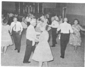
Members of the KRISS KROSS Squares of Ft. Meyers at their recent "GET ACQUAINTED" dance.