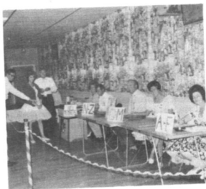
Registration tables at recent 'Marathon' Membership Drive at Southeast Dancers Association.