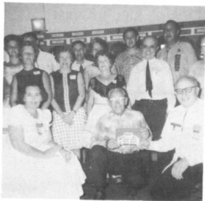
The DIXIE SQUARES of Daytona Beach at a recent Banner-Stealing trip to the Orla Vista Firchouse Squares of Orlando.