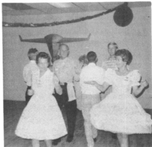
ALL CALLERS AND TAWS? Didn't know callers could dance!