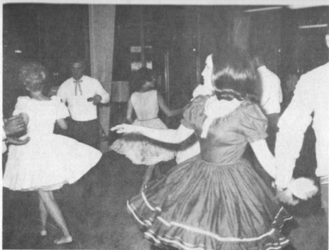
A few of the more than 180 dancers enjoying Memorial Day Square Dance Weekend at Valdosta, Georgia. It is reported this First Annual event was a smashing success.