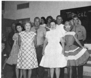
A newly reactivated Club...the Tropical Twisters of Miami.