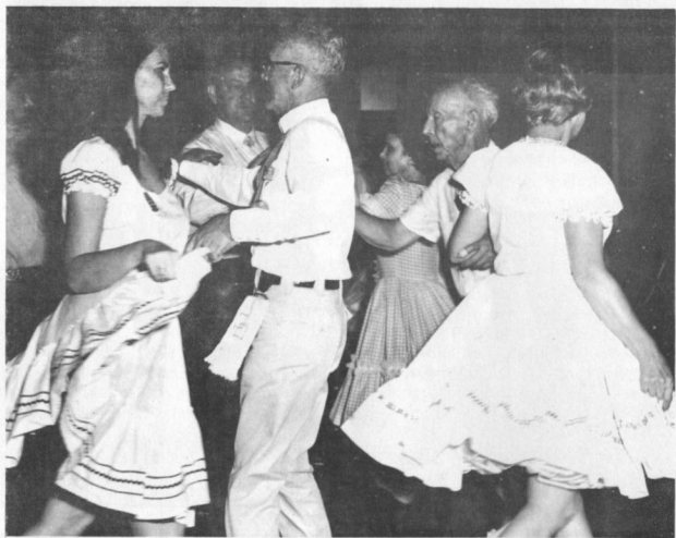
Square Dancers enjoying Homecoming Dance hosted by McCoy's Flying Eights Club.